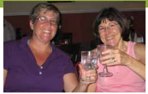
Or Amians enjoyed a delightful dinner at Thai's MaMa Restaurant...