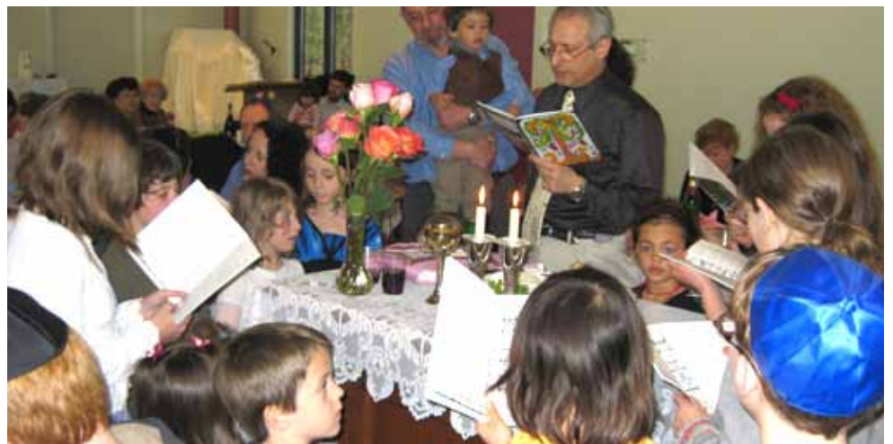
Last year's Seder

As we gather this year on Passover, take a closer look at the flow of the Haggadah. See how important our connectedness is throughout the text. Our sitting down together not only links us to Jews across the world this Pesach, but we reach back through all the years of our Jewish experiences to our ancestors, and theirs- all the way back to the original event. The text is intentional- Every one should create his and her Pesach in such a way that you are there at the original one. There and here at the same time- creating the opportunity for our children to find their future there as well.